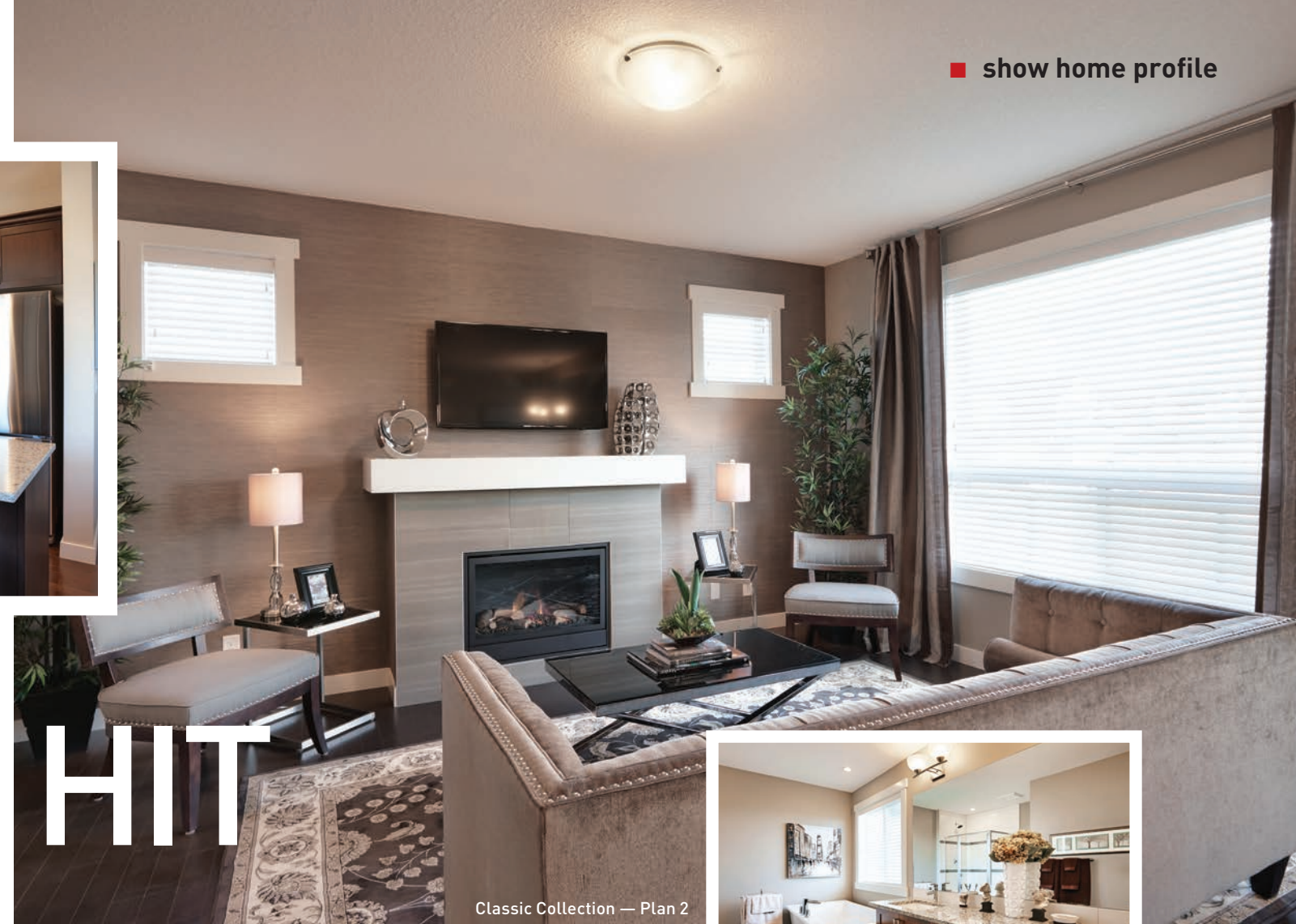
Classic Collection — Plan 2