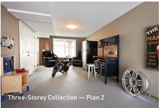
Three-Storey Collection — Plan 2

Upscale architecture and rich, natural color schemes are featured throughout the development.