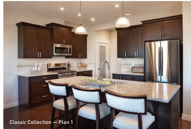
Classic Collection — Plan 1