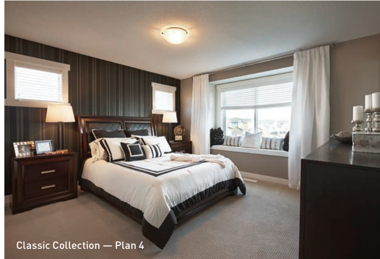
Classic Collection — Plan 4