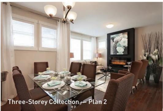
Three-Storey Collection — Plan 2